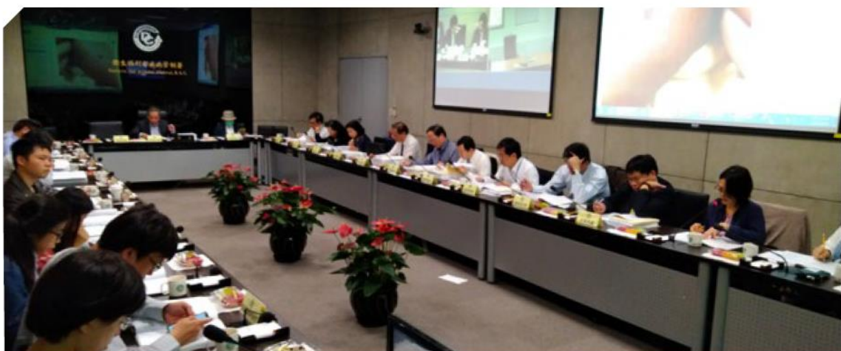
VICP claim evaluation committee meeting