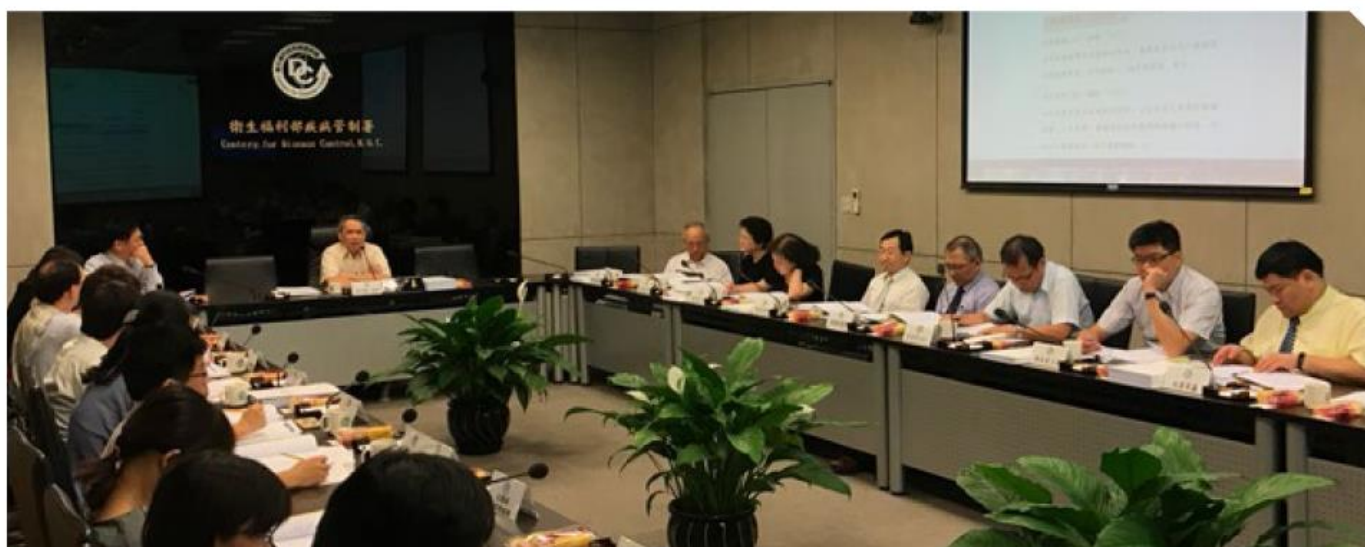
VICP claim evaluation committee meeting