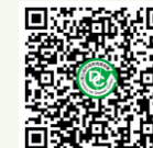
Instructions for using RAT