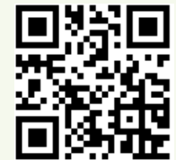
COVID-19 Entry Quarantine and Healthcare Information Website for Inbound Passengers