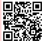
Entry Health Declaration System