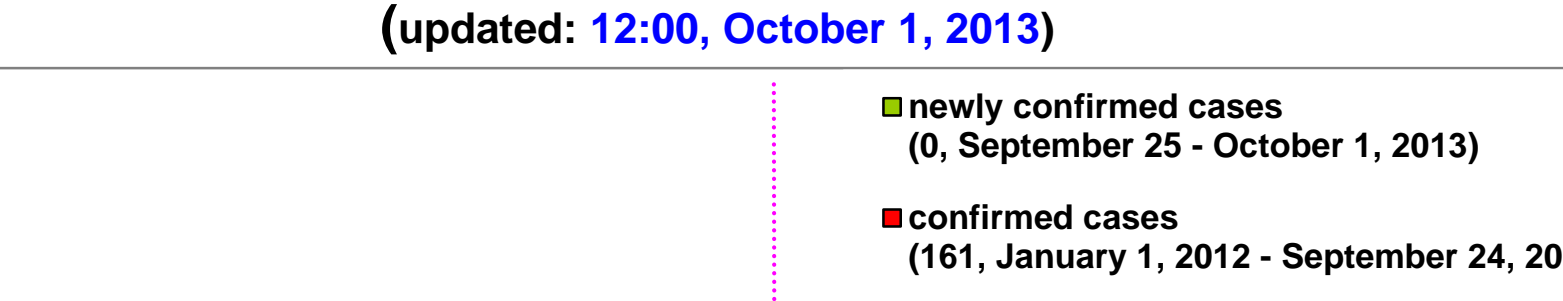
Fig. 2 Trend of EV Infection with Severe Complications, Taiwan, 2012~2013