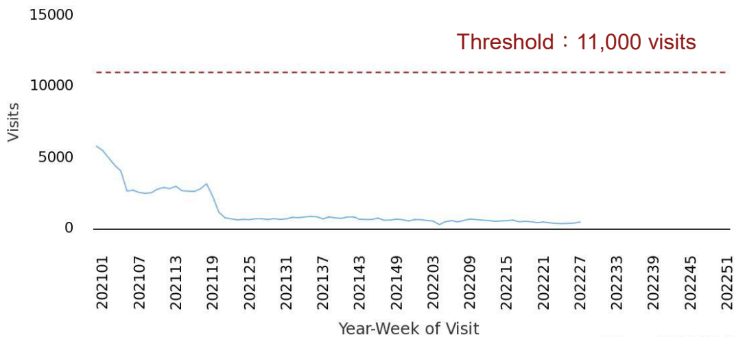
Taiwan CDC 2022 (NHIA)