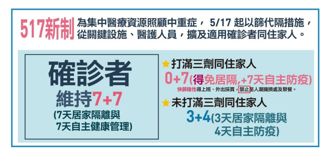
中央流行疫情指揮中心 2022/05/16 17:30更新版

您可以主動聯絡您的公司或學校聯絡窗口,由公司或學校啟動相關應變措施。 如您的同住者未完成 COVID-19疫苗追加劑接種,請留在家中進行3天居家隔離 和4天自主防疫(以最後一次與您接觸的日期為第0天);如同住者已完成 COVID-19疫苗追加劑接種,得免居家隔離(0天),進行7天自主防疫。密切接觸者於接 獲通知居家隔離時,請進行1次快篩檢測;於自主防疫期間,每2-3天快篩一 次,非必要不外出,如需外出,應有2日內家用「快篩陰性」結果,並全程佩戴 口罩。居家隔離和自主防疫期間,如有症狀需再以家用快篩檢測。其他接觸者 注意事項,請參考疾病管制署網站資訊。