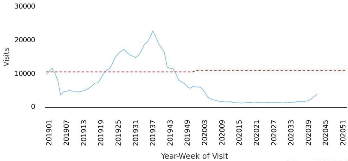
Figure 2. Trend of outpatient and ER visits for enterovirus infection, 2019-2020