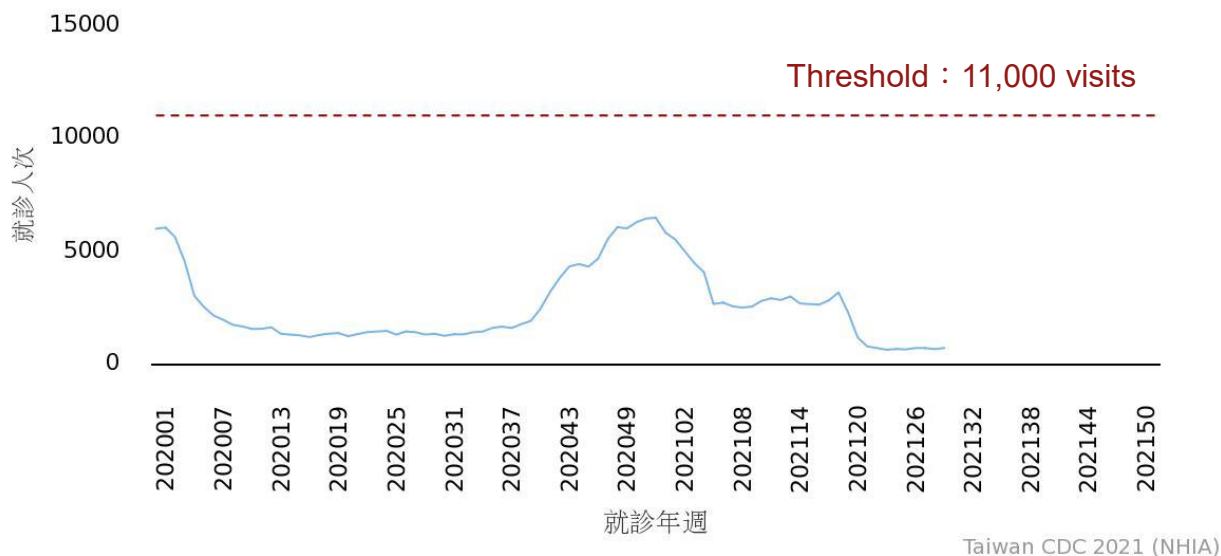
Figure 2. Trend of outpatient and ER visits for enterovirus infection, 2020-2021